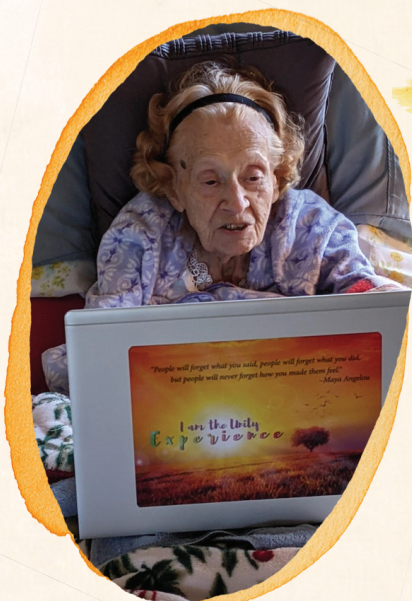
Unity hospice patient connects virtually with her two siblings, ages 97 and 99, via Zoom. The siblings had not seen each other for nearly one year due to COVID-19 nursing home restrictions. Funds from Bader Philanthropies brought such joy and peace to these siblings!

Bader Philanthropies, Inc., is a Milwaukee-based foundation, committed to improving the quality of life of the diverse communities in which it works. The organization funds innovative projects and programs, convenes partners, and shares knowledge to affect emerging issues in key areas such as Alzheimer's & Health Aging, Employment, The Arts, Urban & Jewish Education and Youth Development.